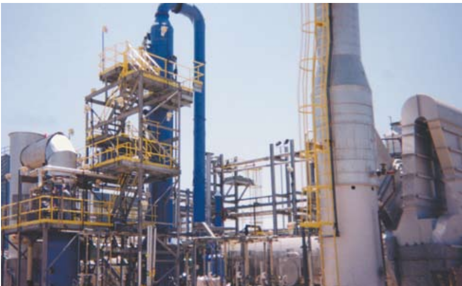
8 MM BTU/hr brominated waste

As a global leader in the thermal oxidizer market, much of our fabrication occurs in strategic locations around the world while proprietary items are fabricated in our own facilities. This approach makes good economic sense, and provides our customers the best value for their combustion system.