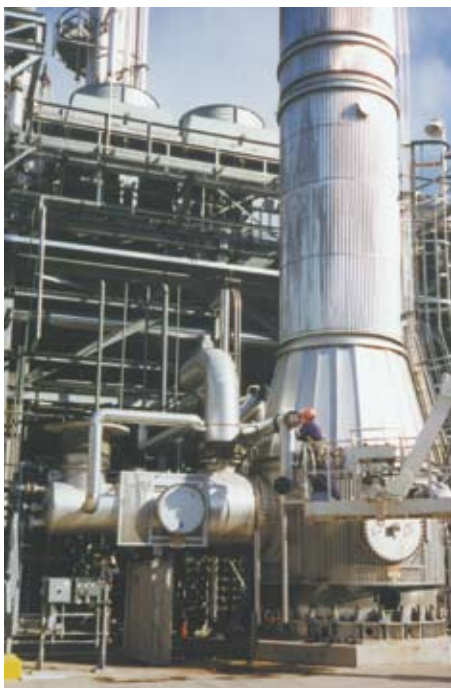
22 MM BTU/hr tail gas unit