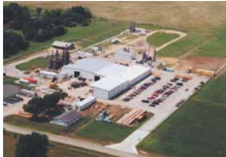
Callidus 82,000 sq. ft. manufacturing and fabrication facility in USA

The Callidus test facility is in continual use for combustion technology research and development as well as customer witnessed demonstrations. Our array of test systems allows us to closely match actual field operating conditions, providing results which will more accurately predict actual measured performance.