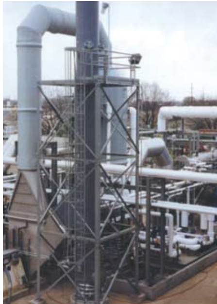
Halogenated Waste Thermal Oxidizer

2200°F with residence times of 1.0 to 2.0 seconds depending on the destruction efficiency required.