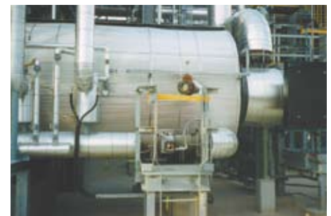
20 MM BTU/hr sulfur plant tail gas incinerator