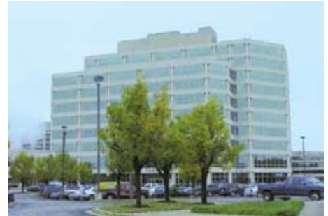
Callidus headquarters - Tulsa, Oklahoma. USA