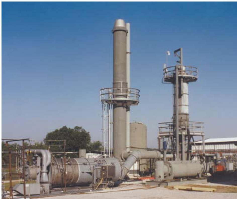
Three stage combustion system at Callidus research facility