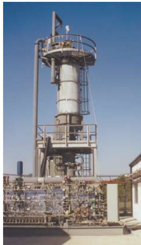
Downfired oxidizer in Callidus research facility