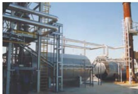
15 MM BTU/hr fume incinerator