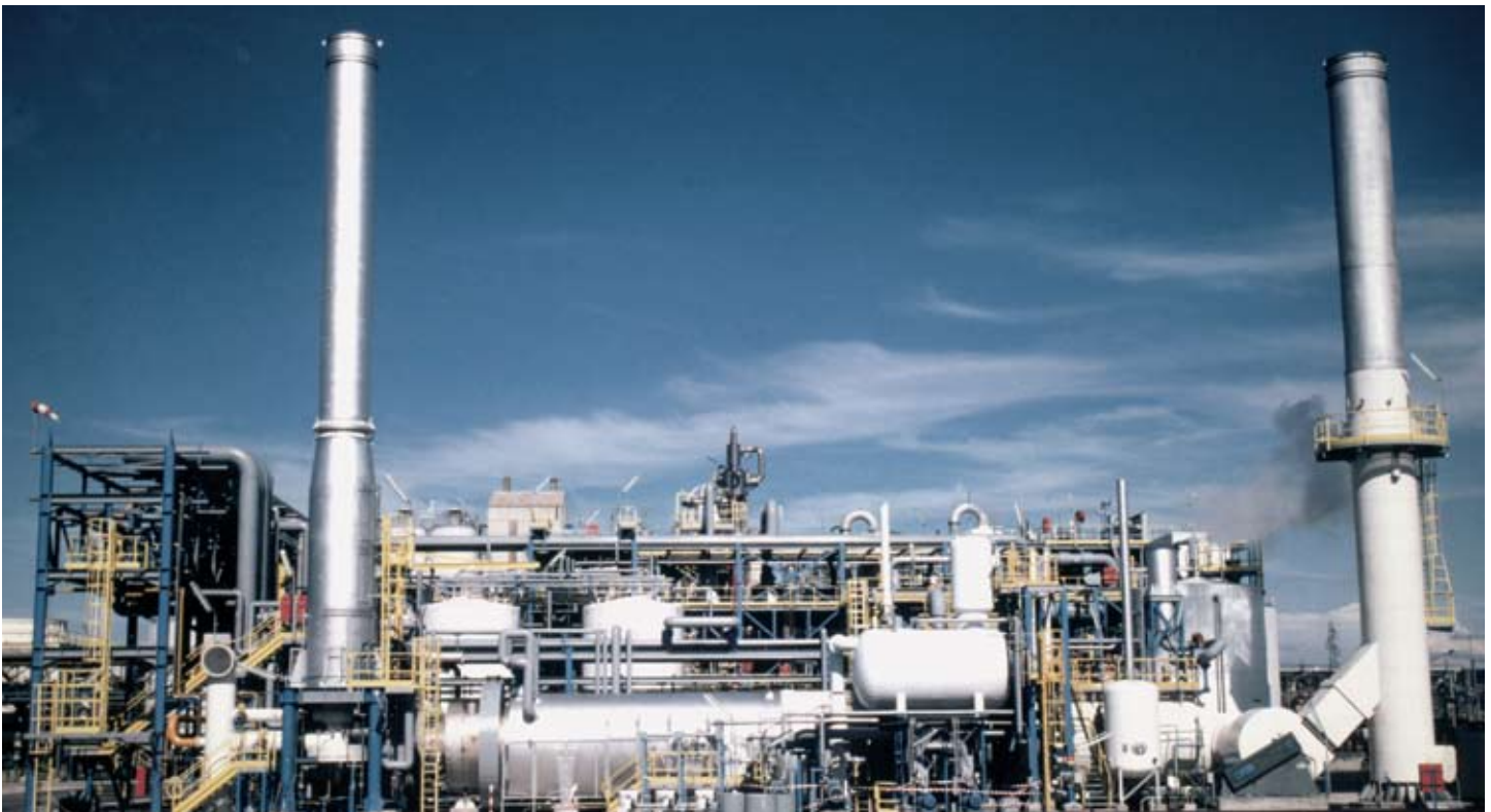
80 MM BTU/hr low NO x system