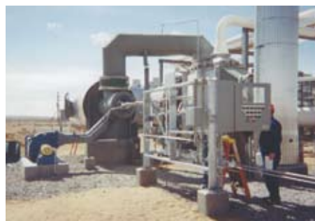
9.5 MM BTU/hr fume incinerator

Destruction efficiencies greater than 99.99 percent may be required for some organic wastes. This is achieved by operating the oxidizer at a higher temperature with minimal auxiliary fuel. Waste heat boilers or hot oil heaters can be used downstream to recover heat for other plant operations.